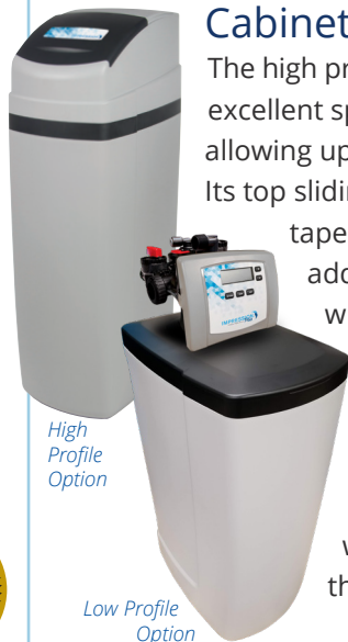
High Profile Option

The low profile allows full access to the control valve for programming and servicing without having to remove the cover.