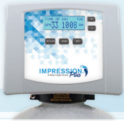
Impression Plus® model shown with backlit display and top flange